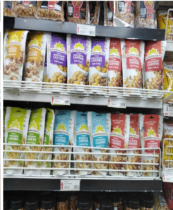
Fig 6. Roasted cashew kernels