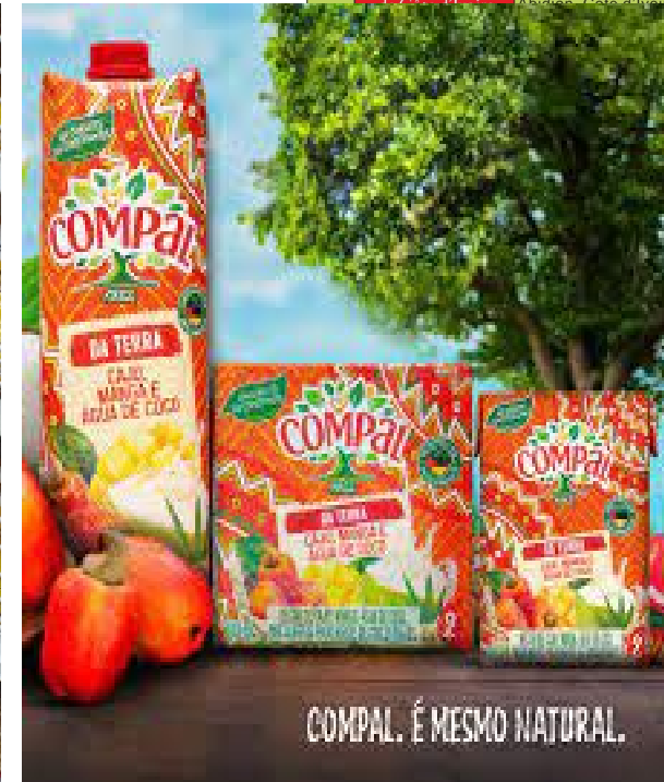
Fig 7. Cashew Juice