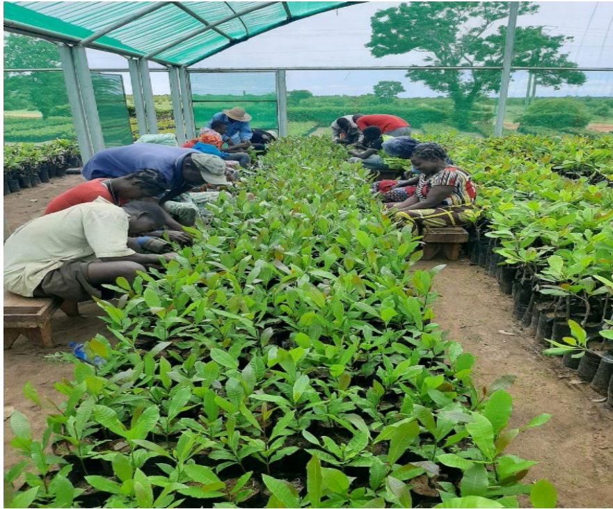
Fig 1: Cashew Nursery