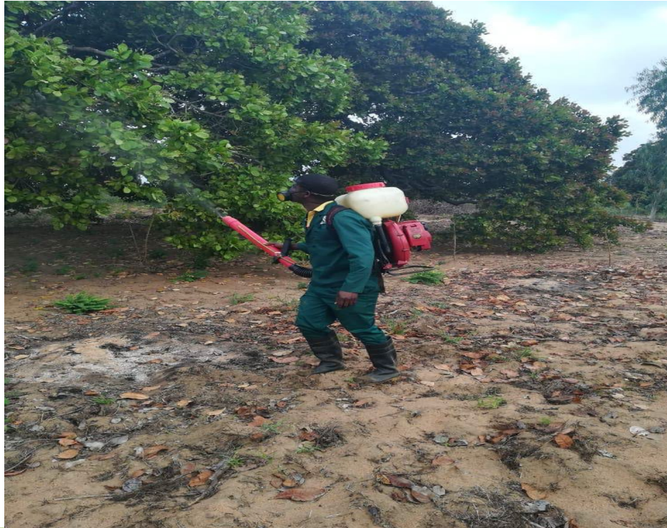
Fig 3: Spraying cashew trees