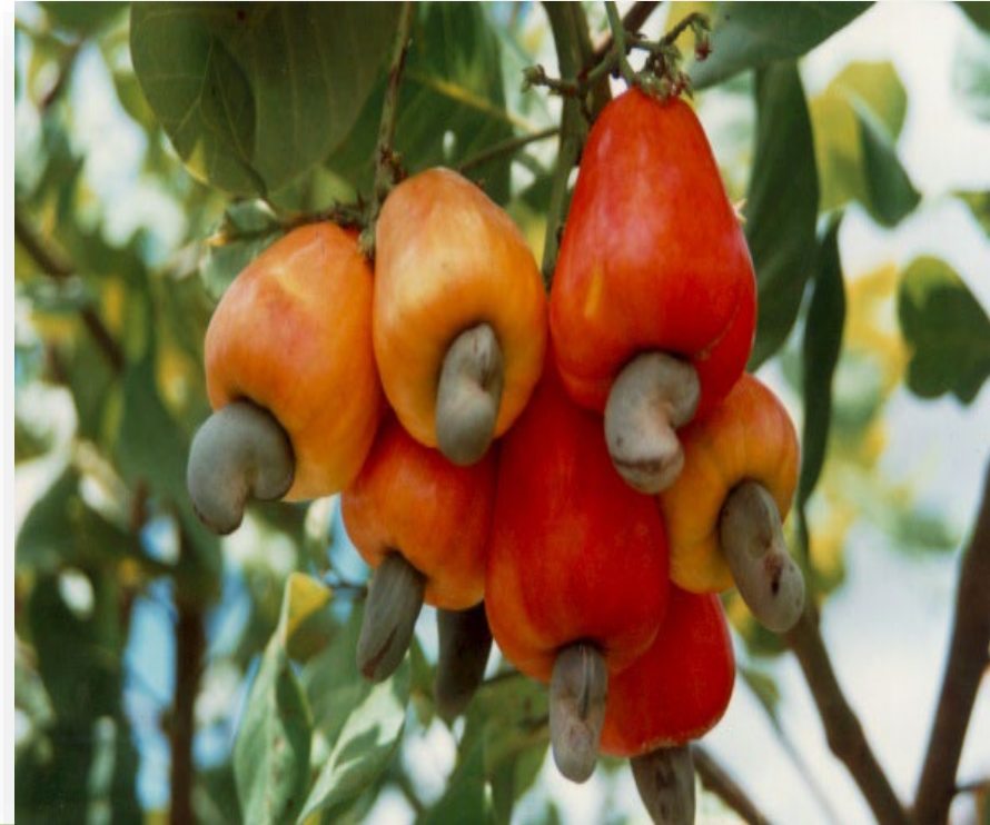
Fig 4. Cashews