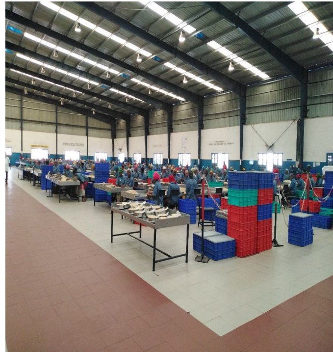
Fig 5: Processing plant