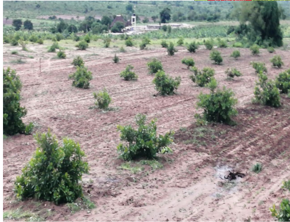
Fig 2. Commercial plantation –polyclonal cashew